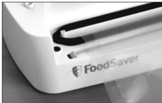
Place Bag in Vacuum Channel